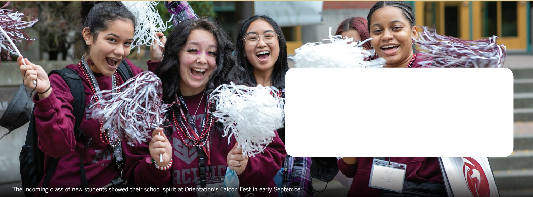
The incoming class of new students showed their school spirit at Orientation’s Falcon Fest in early September.

NATIONALLY RANKED — For the sixth year in a row, Seattle Pacific has been recognized as a “Best National University” by U.S. News & World Report .